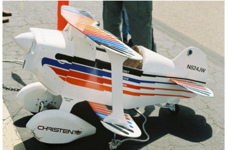
...and the small