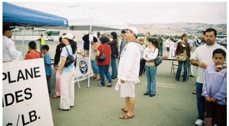
Young Eagles registration