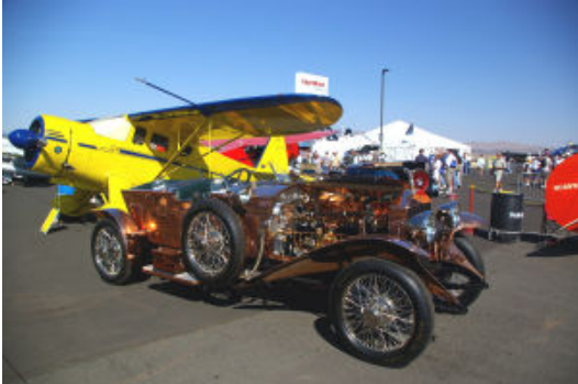
Another Rolls in the Collection