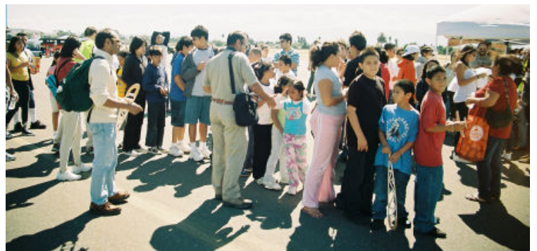
The very long line for the Young Eagle flights