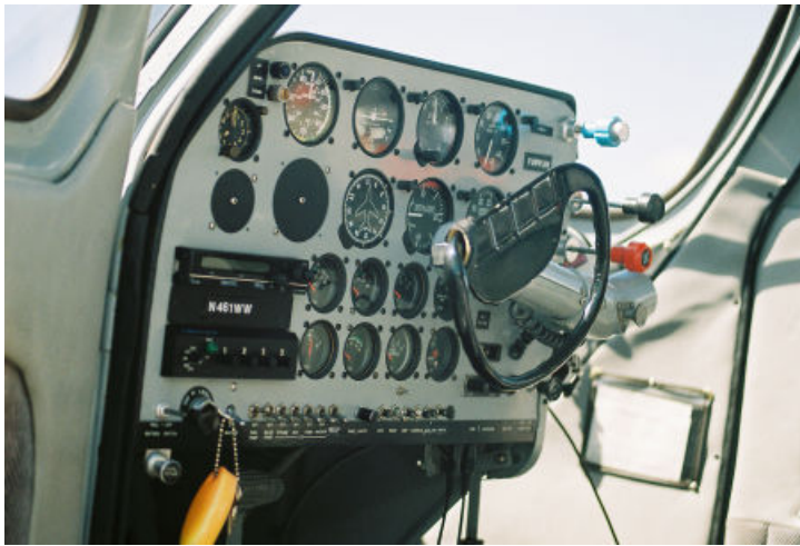
A Seabee panel