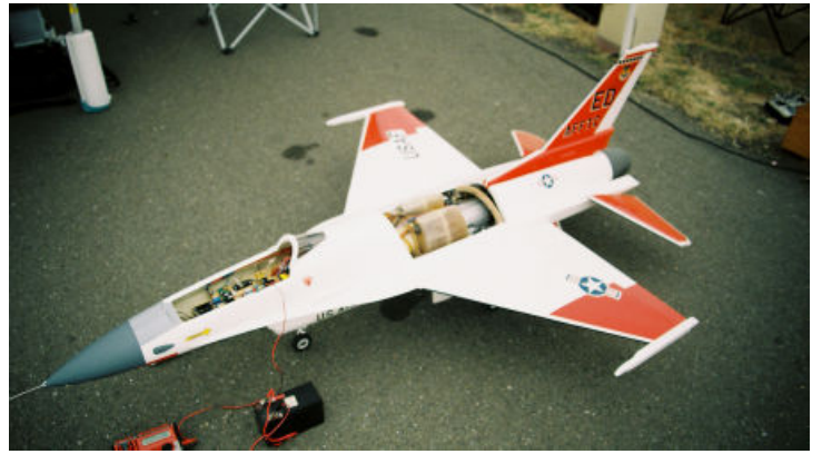
An R/C jet with a real turbine engine