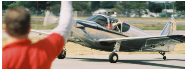
The formation flyers give a wave to the crowd