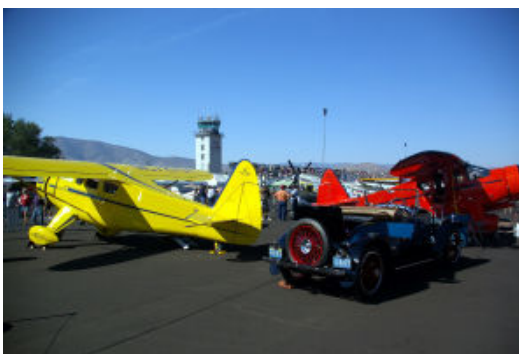
Part of Rolls Royce collection