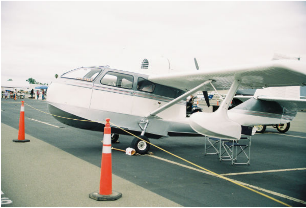
Another pretty airplane without accessories.