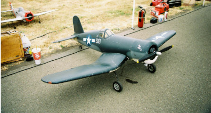
An R/C Corsair