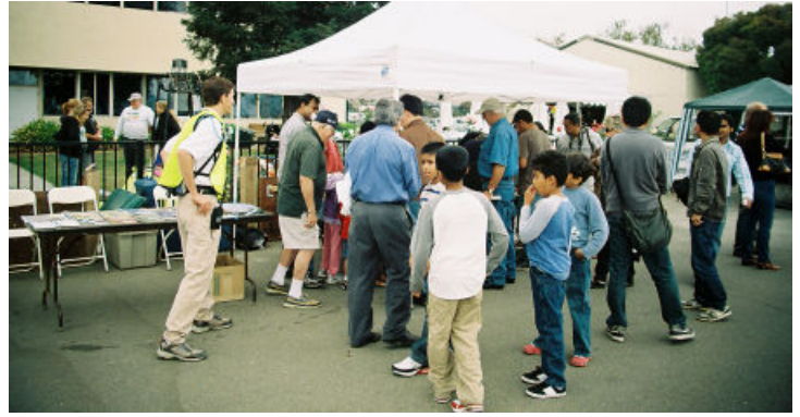
Lining up to build wing ribs