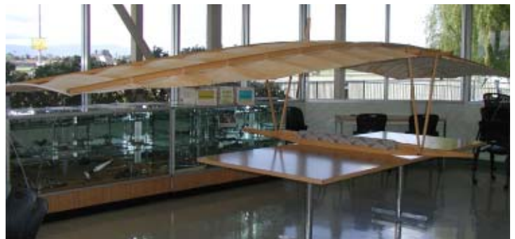
Wing created by the Civil Air Patrol Reid Hillview Airport

This artwork dedication in commemoration of flight pioneer John J. Montgomery was on display on March 15 th at San Felipe and Yerba Buena Roads in San Jose. However, I found it on display inside the terminal building at Reid Hillview Airport.