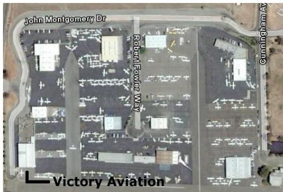
Victory Aviation 2502 John Montgomery Drive San Jose, CA 95148