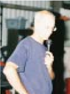
Everyone enjoys the food