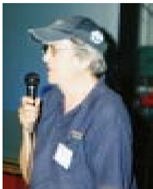
Terri reports on Chapter Leaders Workshop