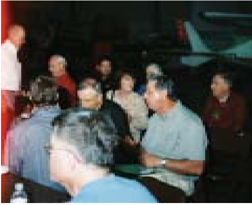
Everyone enjoys the food