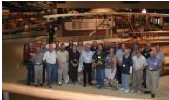
Attendees at EAA Chapter Leaders, September 2008

a year. Some chapters paid for an officer to attend. I have free flights on United, so it just costs me a lot of patience and time flying standby.