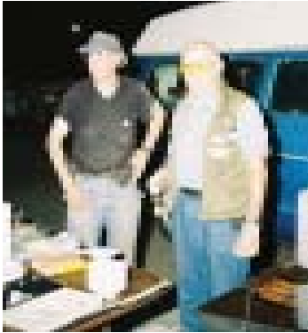
Our trusty cooks