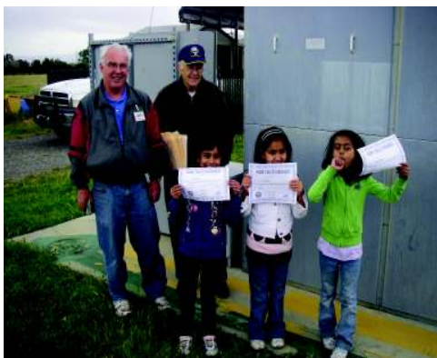
Young Eagle People