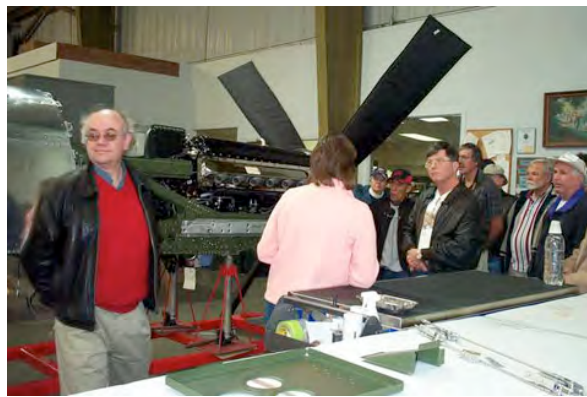
Good turnout with a number of guests