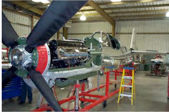
Better than new!

Thanks to everyone for showing up and for our President to arrange the trip.