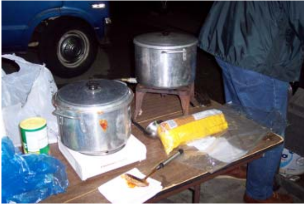
The spaghetti is cooking.