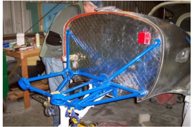
Andy's Legacy gets the engine mount.