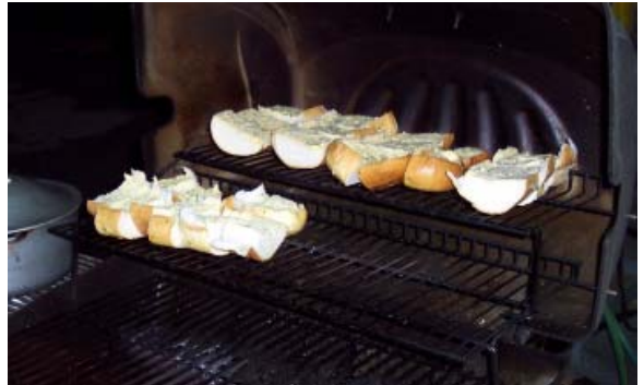
Get the garlic bread ready.