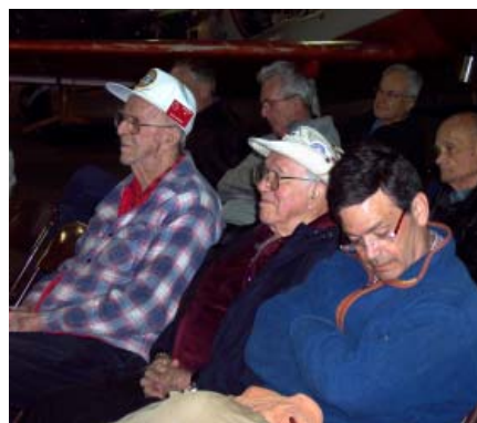
The crowd is taking notes.